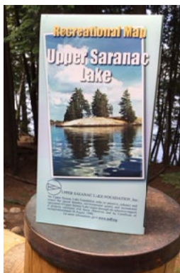
USL Map $5