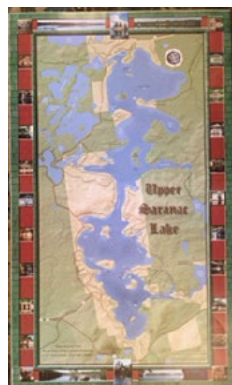
22" x 37" Map Poster $10