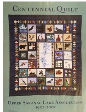
24" x 32" Centennial Quilt Poster $10