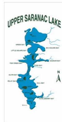
30" x 60" Towel (10.5 lb.) $30