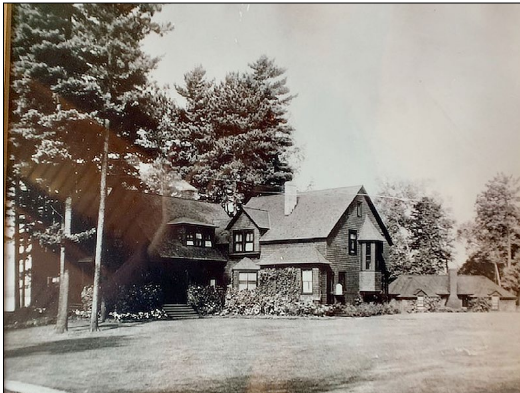
Original Pine Point Camp