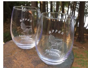
15 oz. Etched Wine Glasses $8 each or Set of 4 for $30