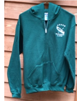
Youth Hoodies (Green Canoe only) S, M and L sizes $30