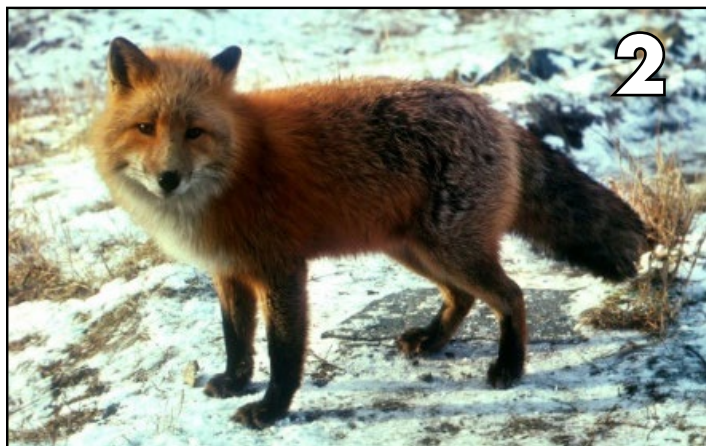
Red fox — Tracks beside tape measure