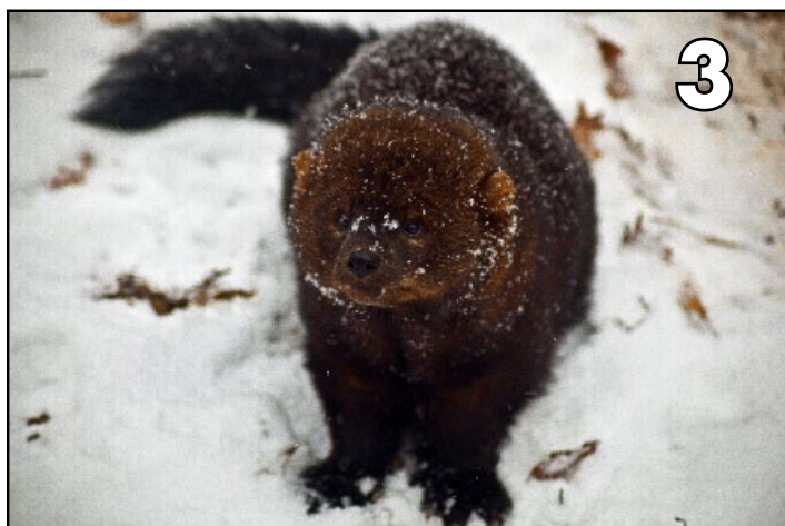
Fisher — Tracks near glove