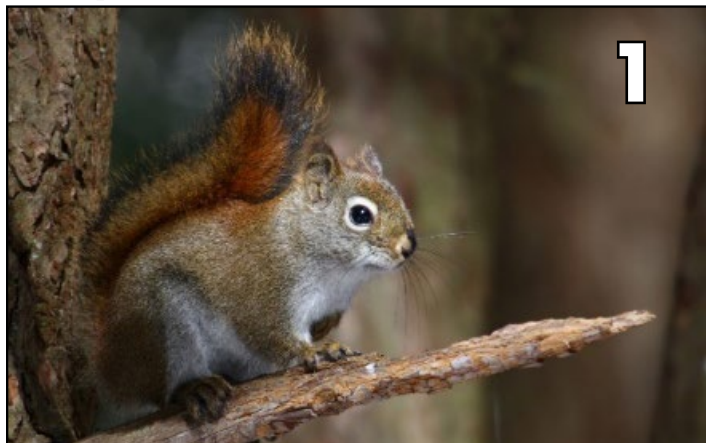
Red squirrel — Tracks on railing