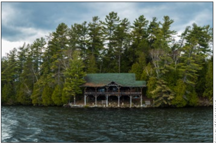
Mariner Boat House

We are thrilled to be a host site for the Adirondack Plein Air