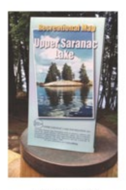
USL Map $5