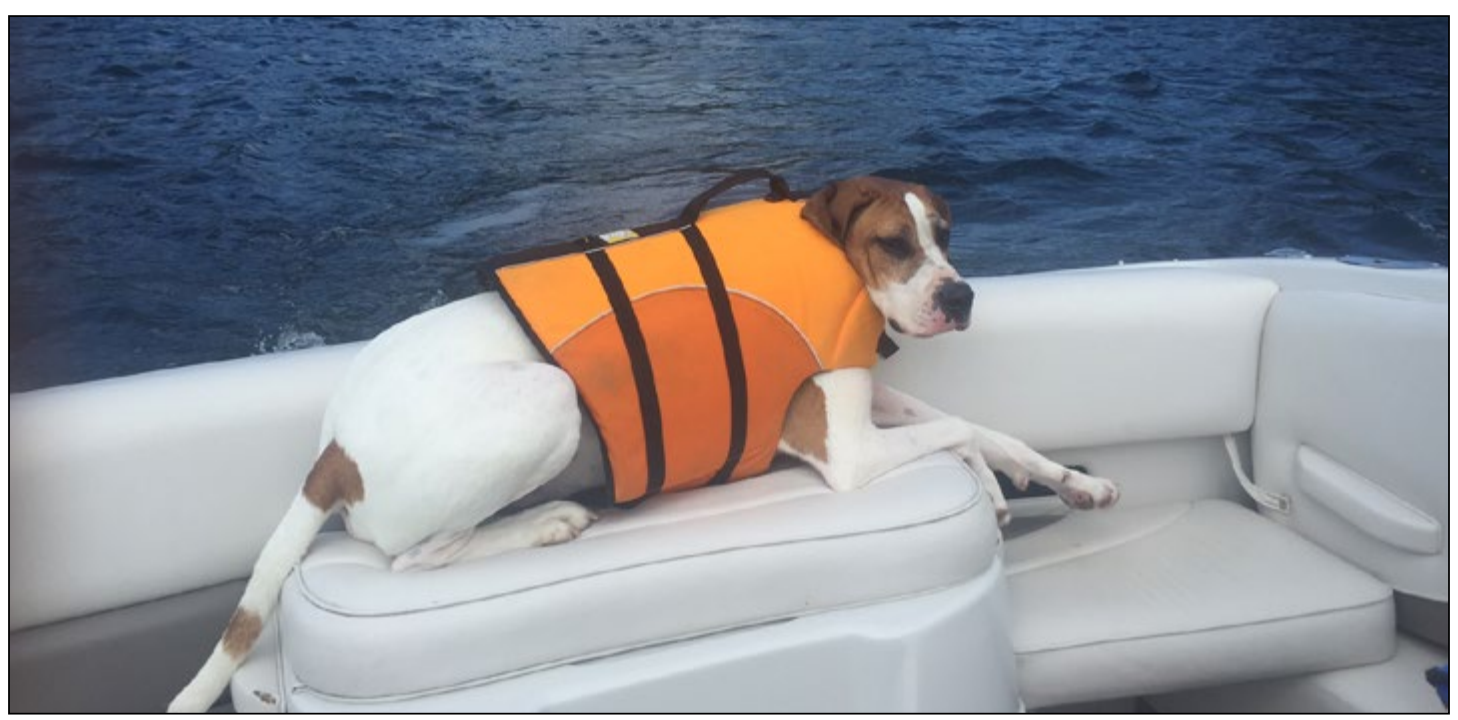
Dog Boat by RyanDean