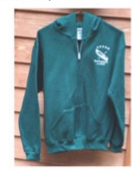
Youth Hoodies (Green Canoe only) S, M and L sizes $30