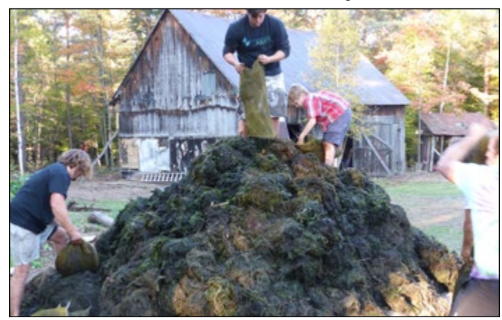
9.5 tons of Milfoil from Fish Creek Campground

The Saranac Headwaters Aquatic Invasive Species Management Project: This project addresses the threat of Aquatic Invasive Species (AIS) and protects citizens' investments by expanding the Upper Saranac Foundation's successful AIS hand harvesting program into the NYSDEC campground at Fish Creek. The Upper Saranac Foundation worked in calibration with the Adirondack Watershed Institute at Paul Smith's College, the Adirondack