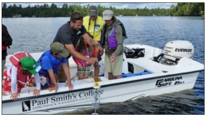
Water Shield Workshop

Park Invasive Plant Program and the Adirondack Foundation. The harvesting portion of this project was funded in part by the Association. The NYSDEC Campground at Fish Creek is a significant source of AIS. The project will reduce the spread of AIS and improve water quality, protecting downstream waters from infestation and help prevent the export of known populations of AIS to non-infested waters.