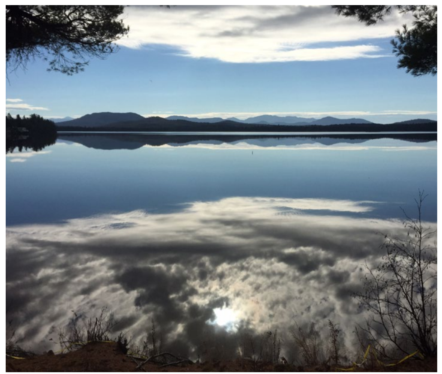
View across the Lake from Lady Tree Lodge

Much has changed around Lady Tree Lodge and the lake over the past 125 years. However, the captivating beauty of this vast wilderness filled with high mountain peaks, clear lakes, fresh invigorating air and abundant wildlife has not. The Forever Wild policy guarantees the view from Lady Tree across the lake, will not change over the next 125 years or ever.