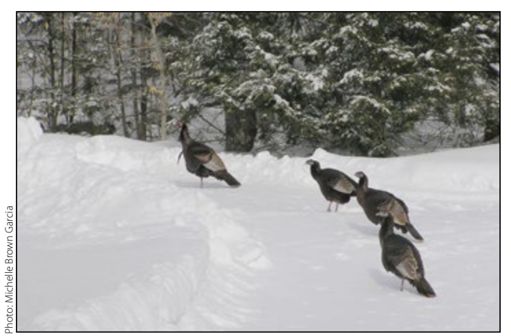
Tom Turkey and his girls 2016

Remember that in NYS any youth between the ages of 10 through 17 must successfully complete a snowmobile safety course in order to earn a certificate, if they operate a snowmobile, on lands upon which snowmobiling is allowed. Snowmobile classes are offered at different locations and most riders take the courses from